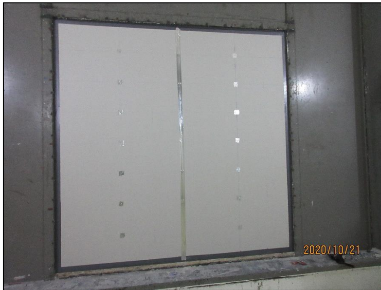
Photo No. 1 Receive Room View of Installed Specimen