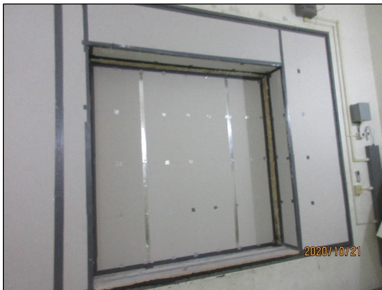
Photo No. 2 Source Room View of Installed Specimen