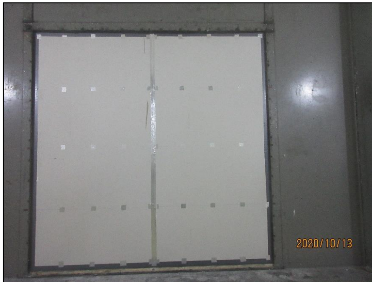
Photo No. 1 Receive Room View of Installed Specimen