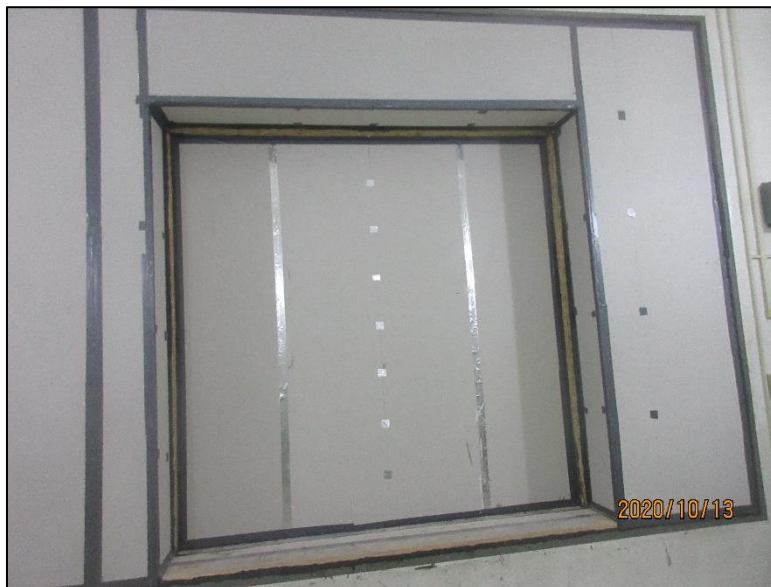
Photo No. 2 Source Room View of Installed Specimen