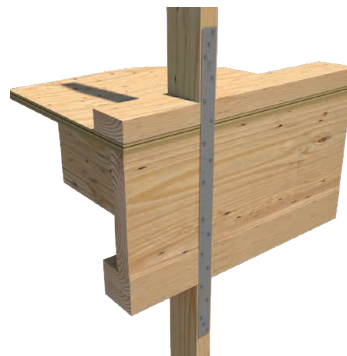
CDLS Series Installation