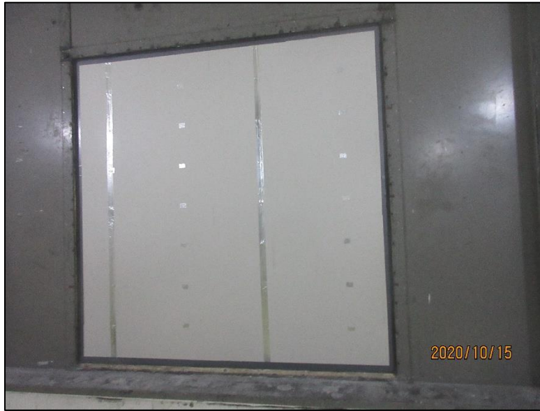
Photo No. 1 Receive Room View of Installed Specimen