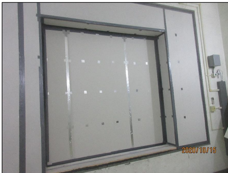
Photo No. 2 Source Room View of Installed Specimen